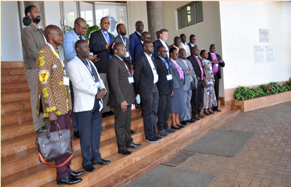
Participants to the church leaders' training in diakonia, leadership and development, Nairobi, November 9, 2021

The All Africa Conference of Churches (AACC) and the World Council of Churches (WCC) jointly organized a training of Church Leaders in Africa. The training that took place at Desmond Tutu Conference Center (DTCC) in Nairobi ran from November 8-12, 2021.