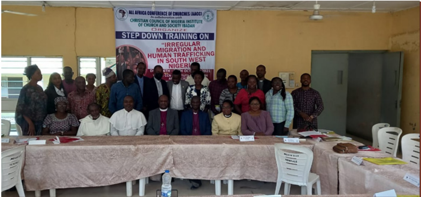
A group photo of the Participants of the Step Down Training on Irregular migration and Human Trafficking in South West Nigeria.

M igration is a complex phenomenon that touches on a diversity of economic, social, security and human right aspects affecting our daily lives in a world that is progressively interconnected.