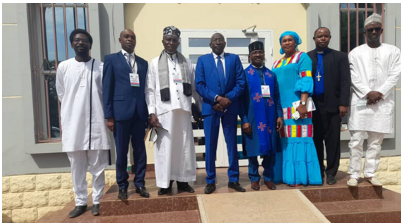
The team was received by Honorable Yankuba JN SONKO (in blue), minister of home affairs and security, photo taken on Dec 3rd, 2021.

The delegation was briefed on the Commission's preparedness, and received assurance of a transparent and peaceful election. The delegation elaborated on the mission of AACC, encouraged them, and prayed for a peaceful election.