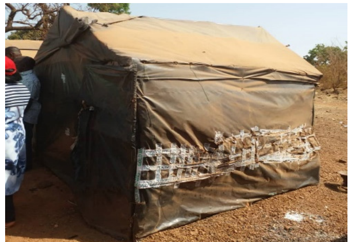
A hut that is closed, maybe the girl is attending to a customer.