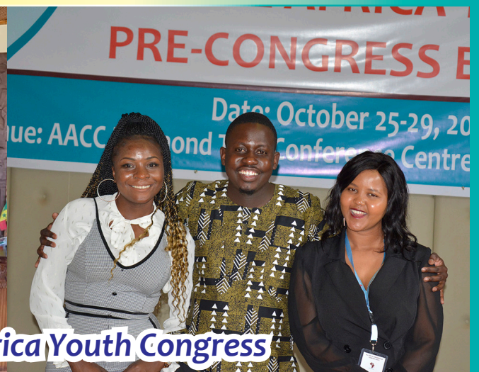
On The Way to The All Africa Youth Congress