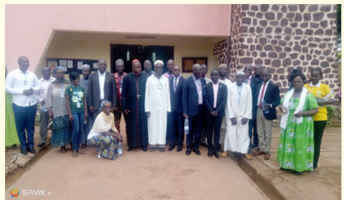
Group photo of the participants to the consultation, photo taken on October 20, 2021

The consultation ended with a communique and call to action. The consultation also provided an opportunity for the religious leaders to revive the Interreligious/interfaith platform, which has been dormant.