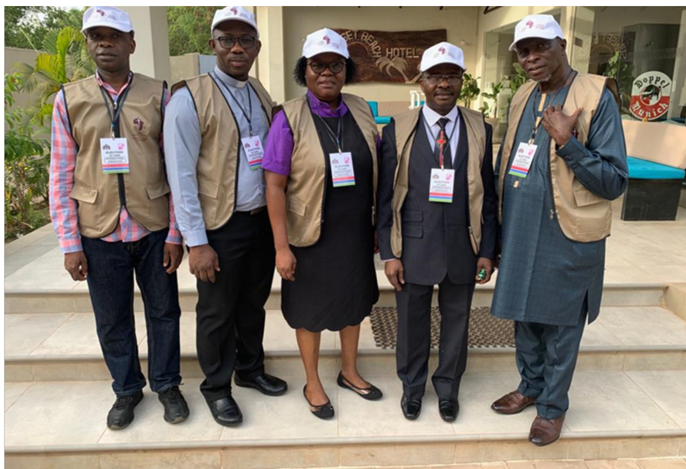
The team ready for the election observation, photo taken on December 4, 2021

A team of five international observers was deployed by the All Africa Conference of Churches (AACC) for a peace mission and election observation for the presidential election that took place in The Gambia on December 4, 2021. The team comprising four religious leaders and one AACC staff member, were there to accompany the Gambia Christian Council, which has been playing a big role in the social, economic, and political life of the Gambia.