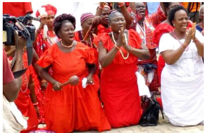
Traditional priests swearing an oath to cancelled/ undo the covenant

The effect of incorporating the Oba (traditional ruler) in the fight was very impactful, with great reduction in trafficking from Edo state.