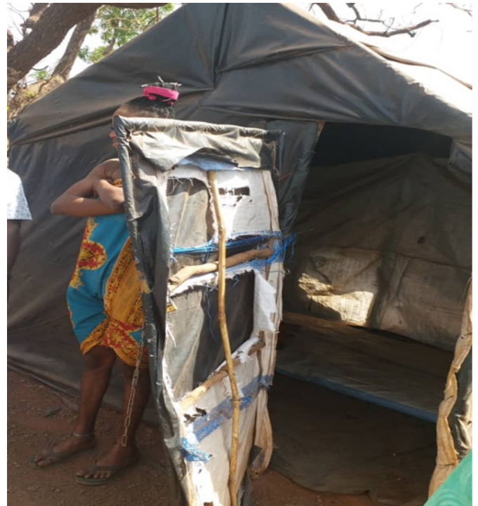
A hut of one of the girls who is by the side waiting for customers

Upon arrival in Burkina Faso some of the girls are sold to madams who run close houses in remote villages,