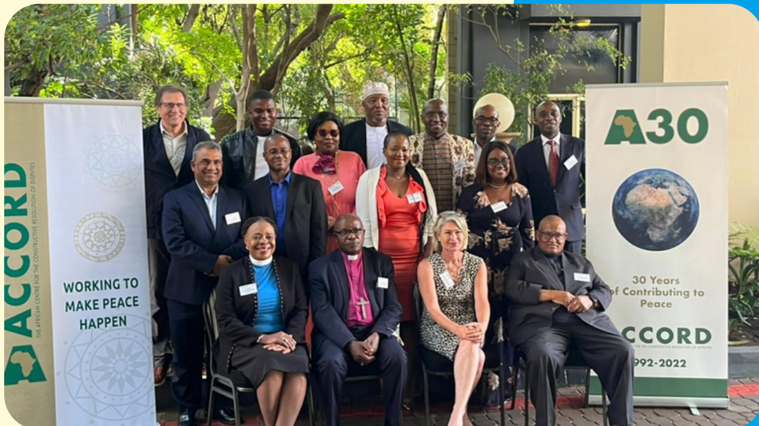
Group photo, the AACC Eminent persons together with the ACCORD staff and leadership, on 29th April 2022 at Sierra Burgers Park Hotel, Pretoria