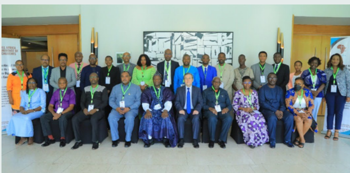
Group Photo of the attendees of the "Enhancing Capacities of the AACC to heighten its Advocacy role for Human Dignity in the Continent Project Launch" in Addis Ababa May 2022

This project will ensure a coordinated advocacy effort by the AACC and its members and other relevant stakeholders on migration, modern slavery, and human trafficking through the AACC Offices in Lomé and Addis Ababa.