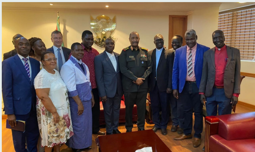
Group Photo of the delegation of the Ecumenical Solidarity Visit to Sudan During their meeting with H.E. Abdel Fattah al-Burhan, Chairman of the Sovereign Council, Photo on 24th April 2022.

The AACC, in collaboration with the World Council of Churches (WCC) and the Fellowship of Christian Councils and Churches in the Great Lakes and Horn of Africa (FECCLAHA), organized an Eminent Persons Ecumenical Programme for Peace in Africa (EPEPPA) visit to Sudan. Sudan continues to face challenges following the military coup of 25th October 2021. Civil strife and economic crisis have continued where the population is experiencing a lot of challenges.