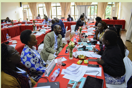
A section of the participants in a group discussion at the Capacity Strengthening Session on Sustainable Population Growth in Africa.

In conclusion, the participants committed themselves to engage with the Church, the government, and all relevant stakeholders in sustainable population dialogues.