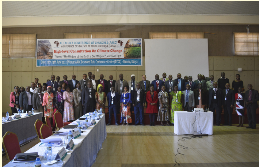
Group Photo of the Participants at the AACC High-Level Consultation On Climate Change on 21st June 2022

The AACC held a High-Level Continental Consultative Meeting on Climate Change in Nairobi, Kenya at the DTCC from 21st June 2022 to 23rd June 2022, under the theme: “The Welfare of the Earth is our Welfare” Jeremiah 29:7 . The meeting drew delegates from the AACC members, religious leaders from different faiths, academia, Civil Society, the African Union, development partners, media, and interest groups such as women, youth, and persons with disabilities.