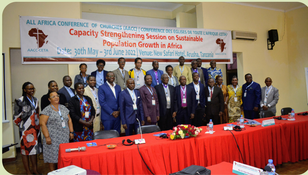
Group Photo of the Participants at the Capacity Strengthening Session on Sustainable Population Growth in Africa, Arusha Tanzania on 31st May 2022

The AACC continued to highlight the issue of sustainable population growth and its impact on development in the continent. This work was amplified at a capacity strengthening session on sustainable population growth in Africa; that was held in Arusha Tanzania from 30th May 2022 to 3rd June 2022, with participants being drawn from the continent.