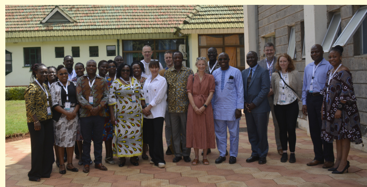
Group Photo of AACC Staff and Partners after The Partners Consultation on 26th May 2022